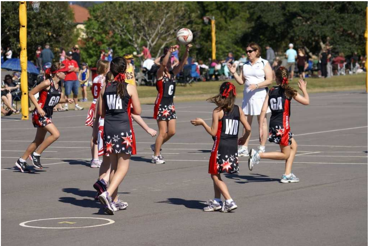
11 C Topaz