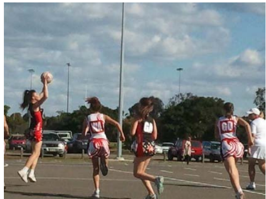
14 A Silver in action during their final game