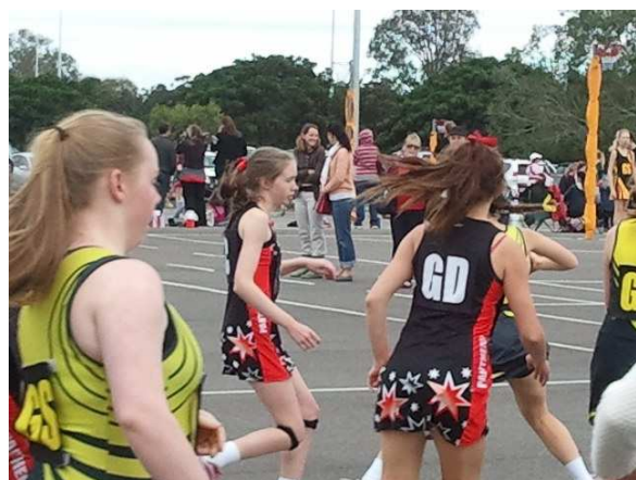
Inter 3 Gold