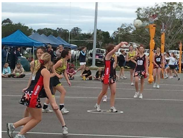
Inter 3 Gold

Check out some of our Panthers players in action from the recent PRNA carnivals.