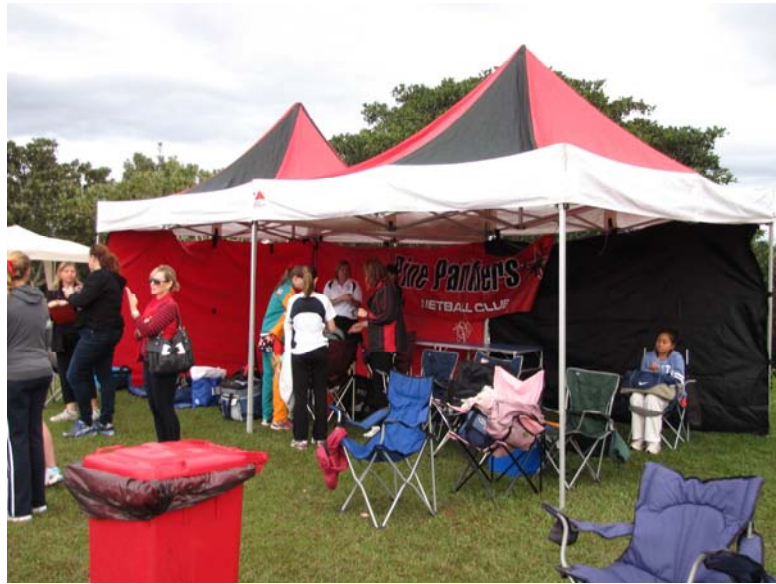
Pine Panthers Tent (at 7.30am!!)